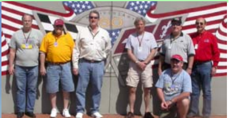
The Current and some past presidents of the A.C.C.C.