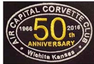
Patch for Hat/etc.