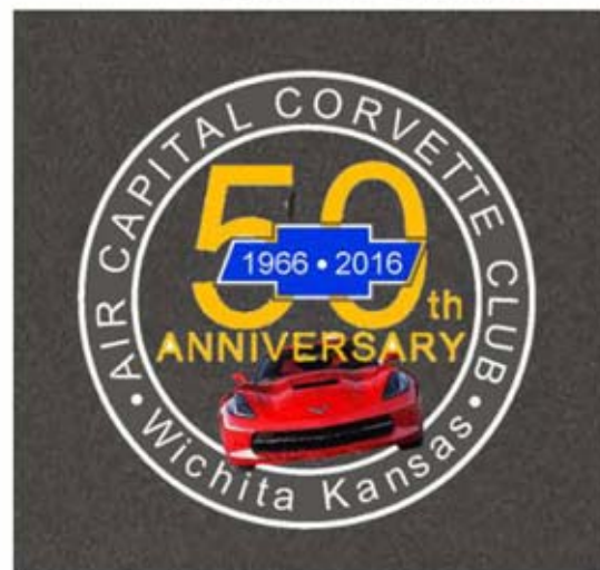
Enlarged pocket logo